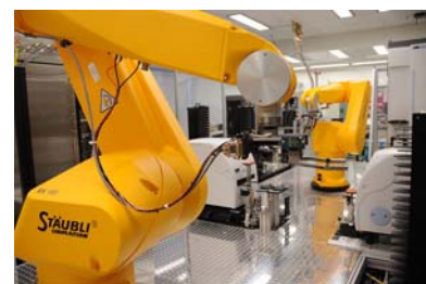
High Throughput Screening equipment