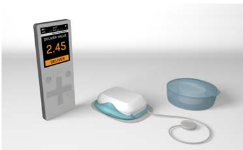
Insulin Patch Pump developed by IPD med